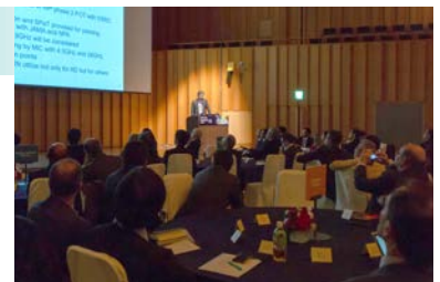
Breakout Workshop Summary Sharing the results on each theme

All the presentation materials and exhibited posters are available at: http://en.sip-adus.go.jp/evt/workshop2018/