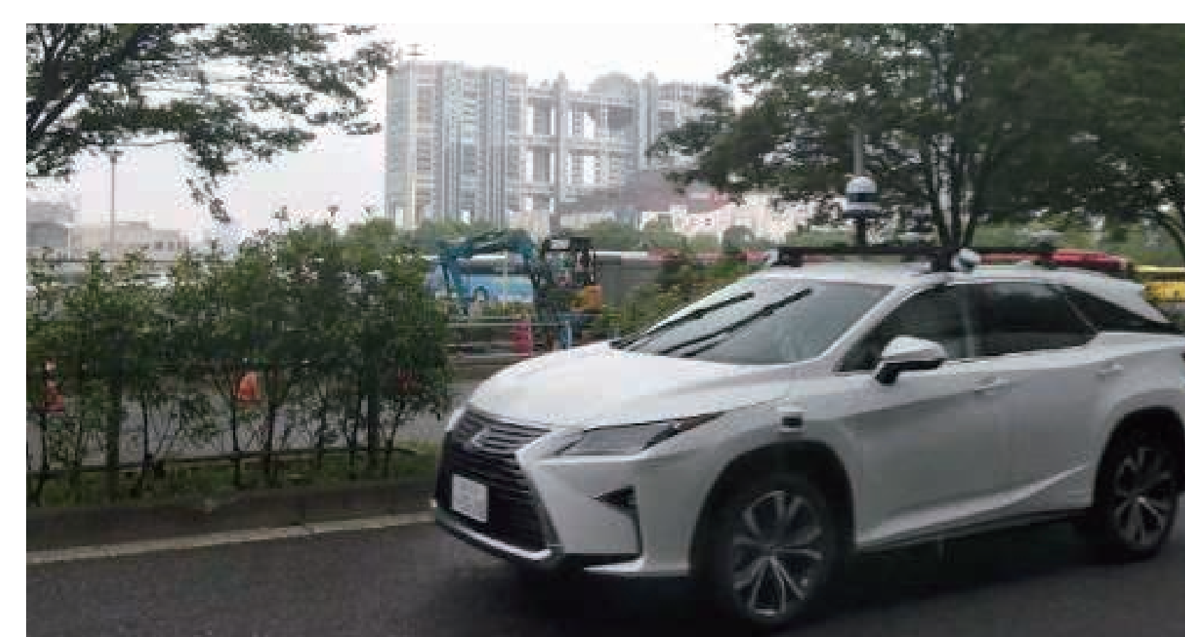
Public road demonstration experiment at Tokyo waterfront area