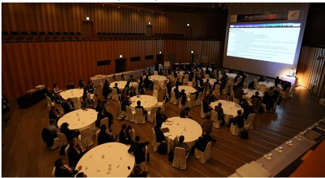
Breakout Workshop Summary : Result sharing