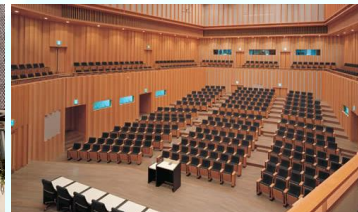
Conference Hall (418 seats)