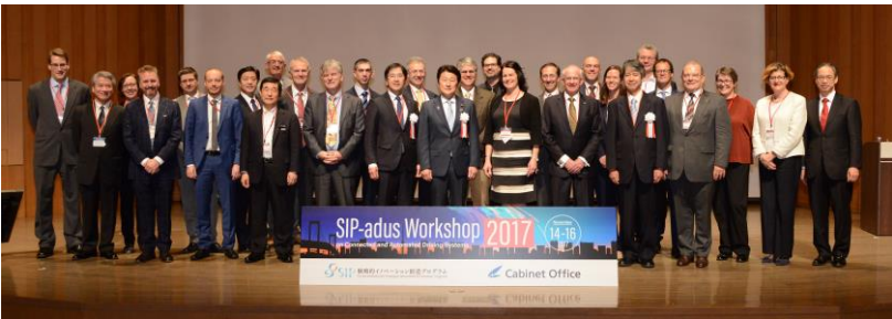
CAO Minister Matsuyama and overseas speakers