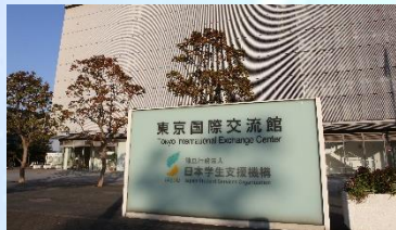
Tokyo International Exchange Center

Tokyo Academic Park, 2-2-1 Aomi, Koto-ku, Tokyo 135-8630 Japan